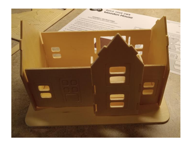
Figure 6. Install front gable