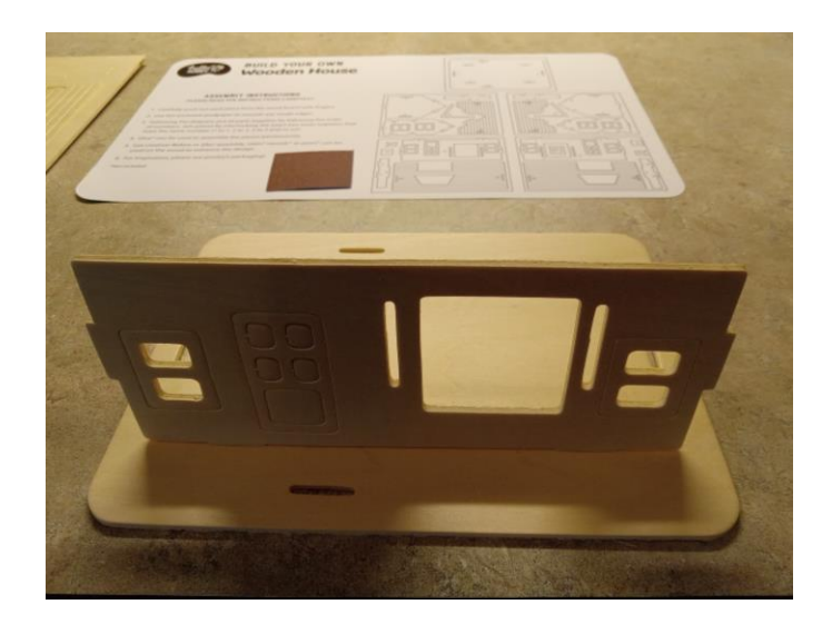
Figure 2. Install the front wall