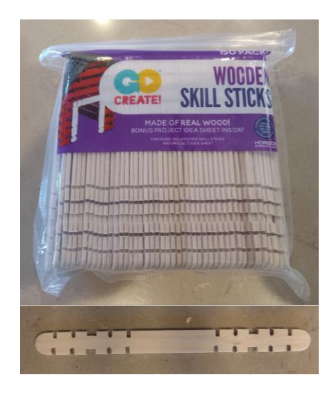
Figure 14. Wooden Skill Sticks

Craft sticks are available with a series of precut grooves to allow the assembly of stable structures without glue. The package shown in Figure 14 comes with instructions for assembling a barn.