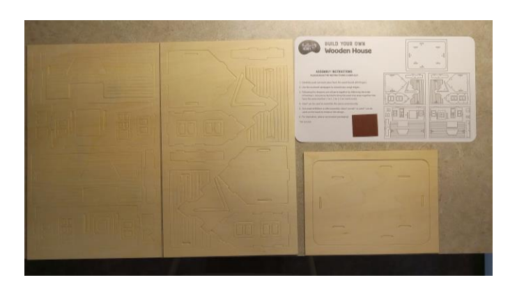
Figure 1. Kit contents

The Hello Hobby "Build Your Own Wooden House" kit is available at WalMart.com and some retail outlets. The parts and instructions are shown in Figure 1. The assembly process is displayed in Figure 2 through 12.