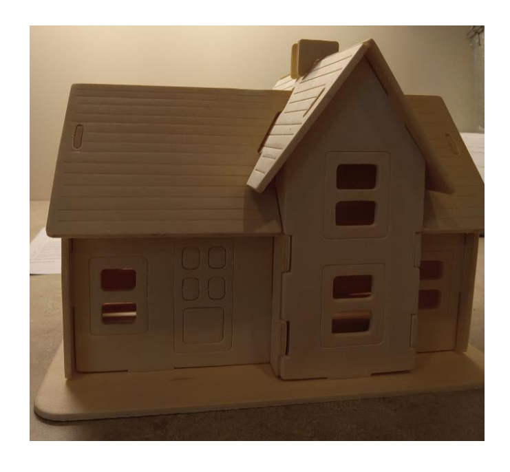
Figure 11. Place chimney

Glue the five chimney pieces together and place on the roof (Figure 11).