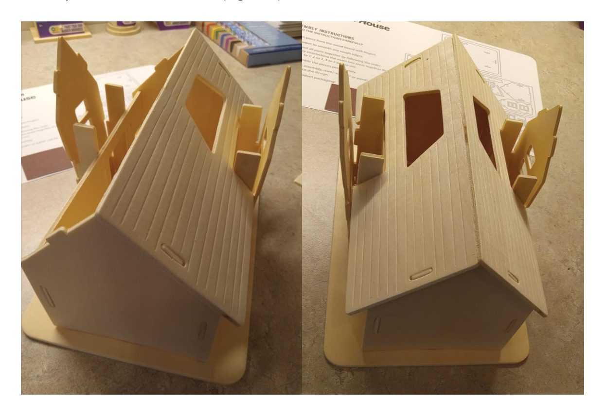
Figure 8. Install main roof panels

Install the panels for the main roof (Figure 8).