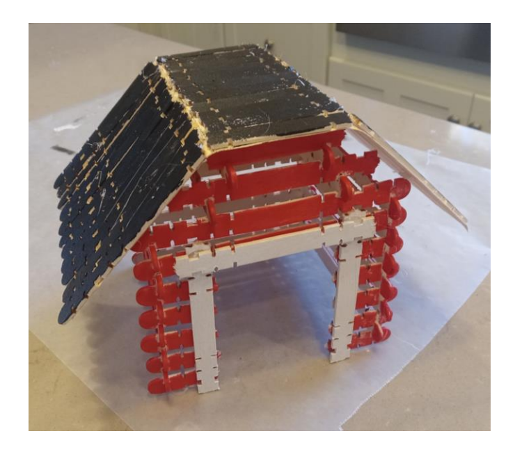
Figure 17. Complete barn

Painted craft sticks are glued to the manila folder roof sheathing (Figure 17).