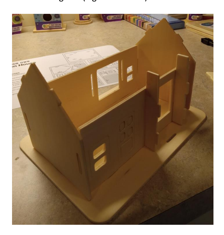
Figure 5. Add bump-out for front gable

Place the bump-outs for the front gable (Figures 5 and 6).