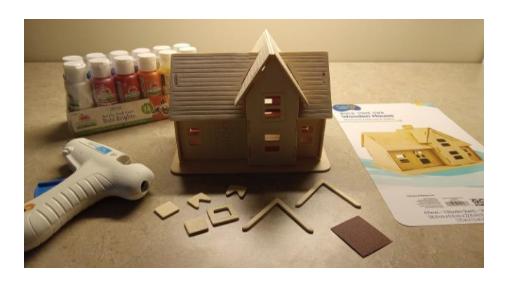
Figure 12. Finish gluing trim and use paints to finish the house

Option: Place the house on a sheet of cardboard or poster board and add driveway, sidewalk, patio, or other features.