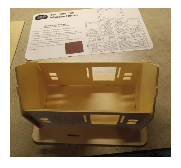
Figure 4. Finish assembling 4 walls

Place the bump-outs for the front gable (Figures 5 and 6).