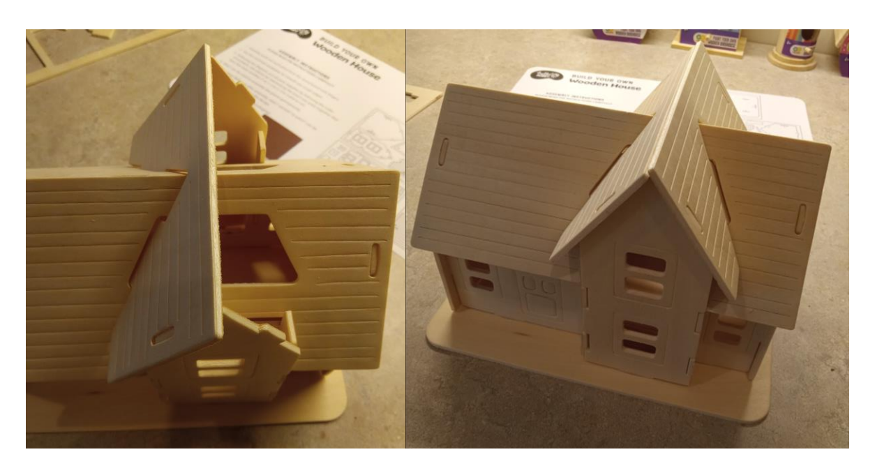
Figure 9. Complete the roof