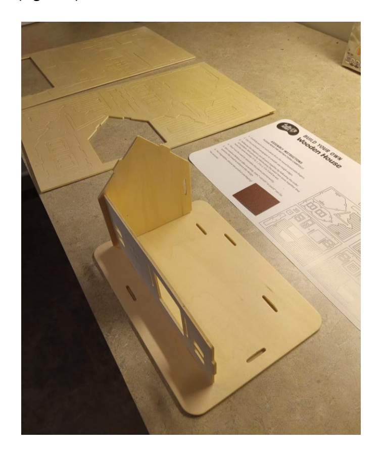
Figure 3. Add a side wall