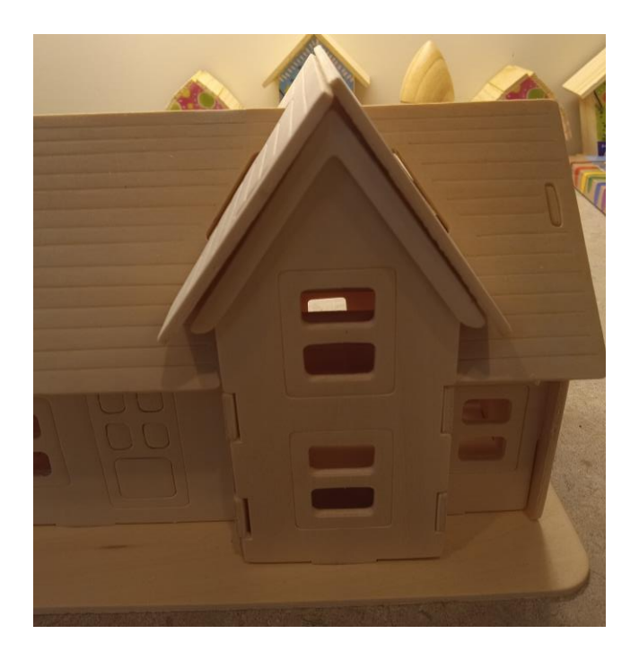
Figure 10. Glue gable-end trim, both sides

Glue the gable-end trim on the front and back doors (Figure 10). The adult supervisor may wish to use a hot glue gun to speed the process.