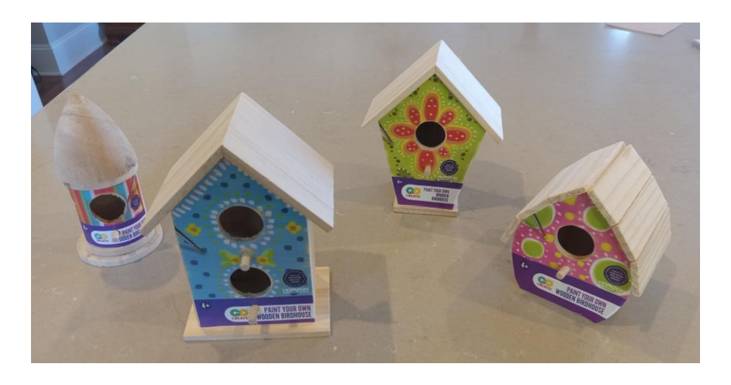
Figure 13. Small, inexpensive, paintable birdhouses (suitable for indoor display only)

Small prefabricated models of houses can be purchased in many craft departments. Figure 13 shows some inexpensive samples sold under the Go Create trade mark. These are appropriate for children 4 years old and over. After removing the front label, they can paint or decorate the house. Other materials such as moss, pine needles, acorns, colored leaves, raffia ribbon, etc. could be glued on.