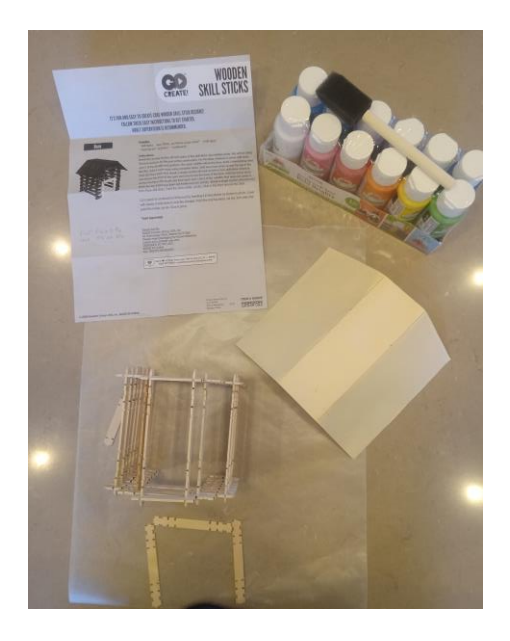
Figure 15. Barn under construction

The structure of the roof, shown in Figure 15 along with the partially completed structure, was made from a quarter of a manila folder.