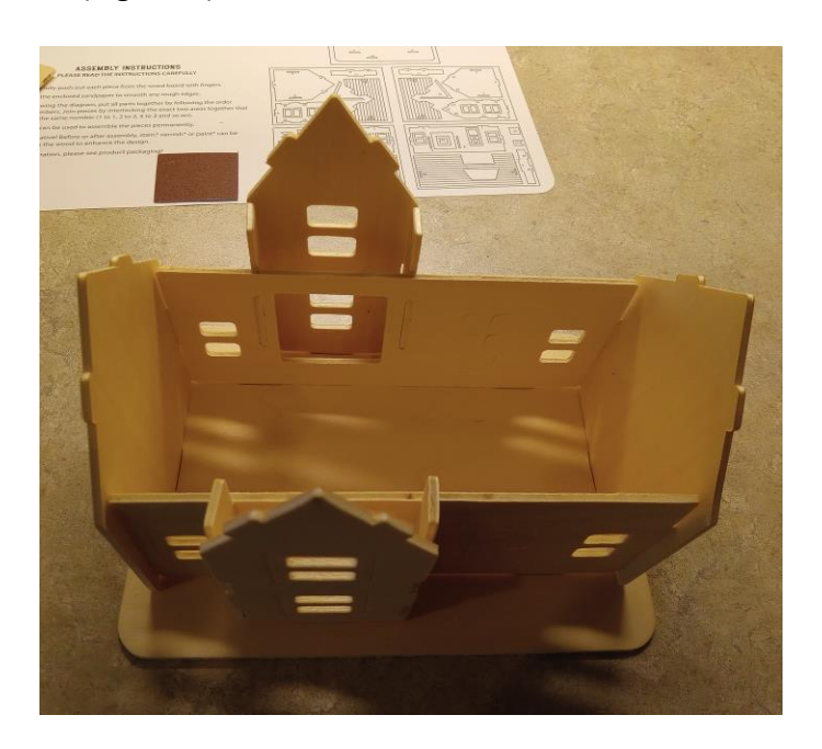
Figure 7. Repeat bump-out and gable for back side